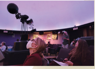
ORIGINAL PLANETARIUM TECHNOLOGY FEATURING HOLES DRILLED INTO METAL TO VIEW CONSTELLATIONS.

C&N Mid Penn Bank People's Securitγ Bank & Trust Univest Financial Waste Management Weis Markets