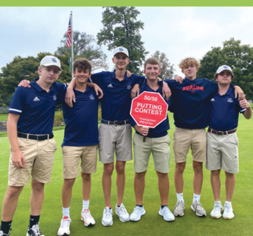
ANNUAL GOLF CLASSIC