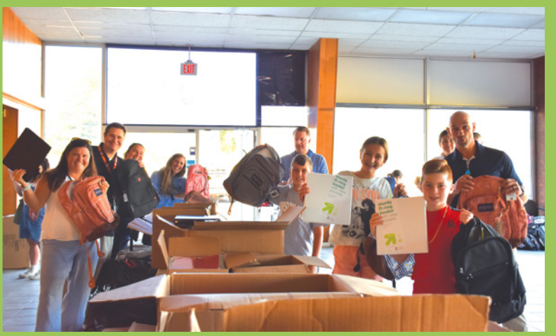
BUILD-A-BAG COMMUNITY BACKPACK + SCHOOL SUPPLY DRIVE